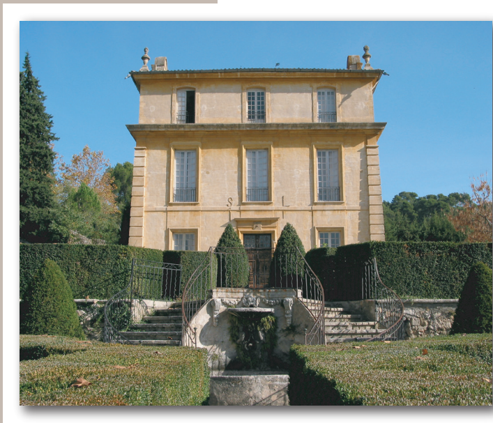
Europe-Asia Research Institute