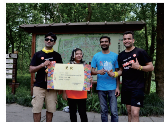
Students Participation in Dragon Boat Race