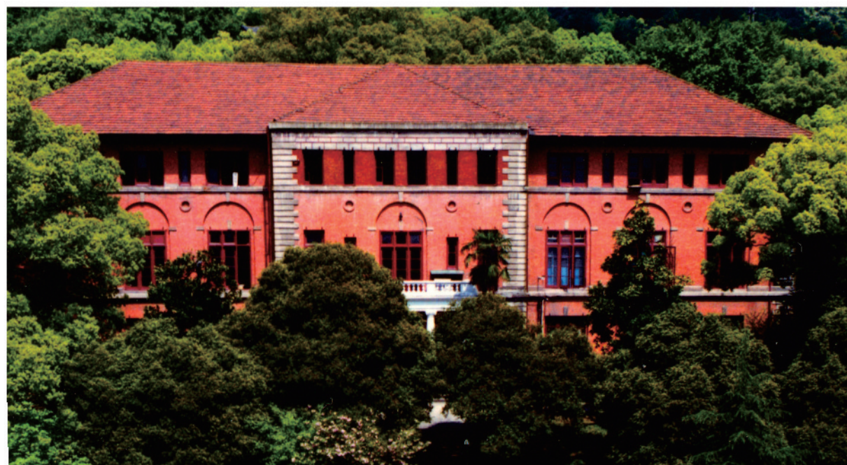
The Main Building of ZJU Law School

Note: Application materials will NOT be returned regardless of the result of the application