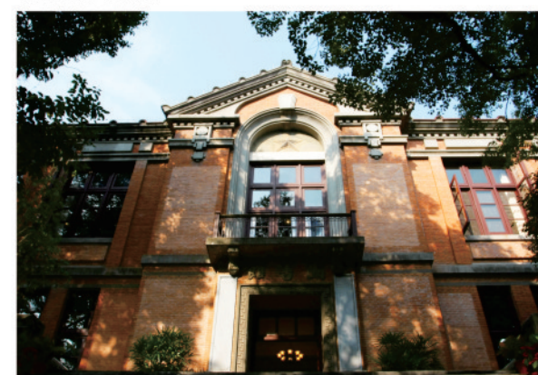
The Law Library