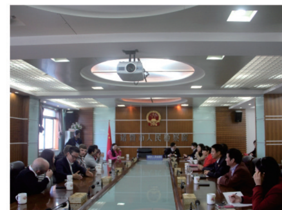
Symposium in People's Procuratorate of Zhuji City