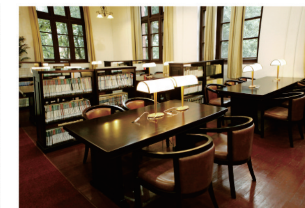
The Reading Room