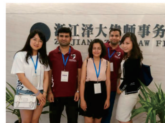
Visit to the ZheDa Law Firm