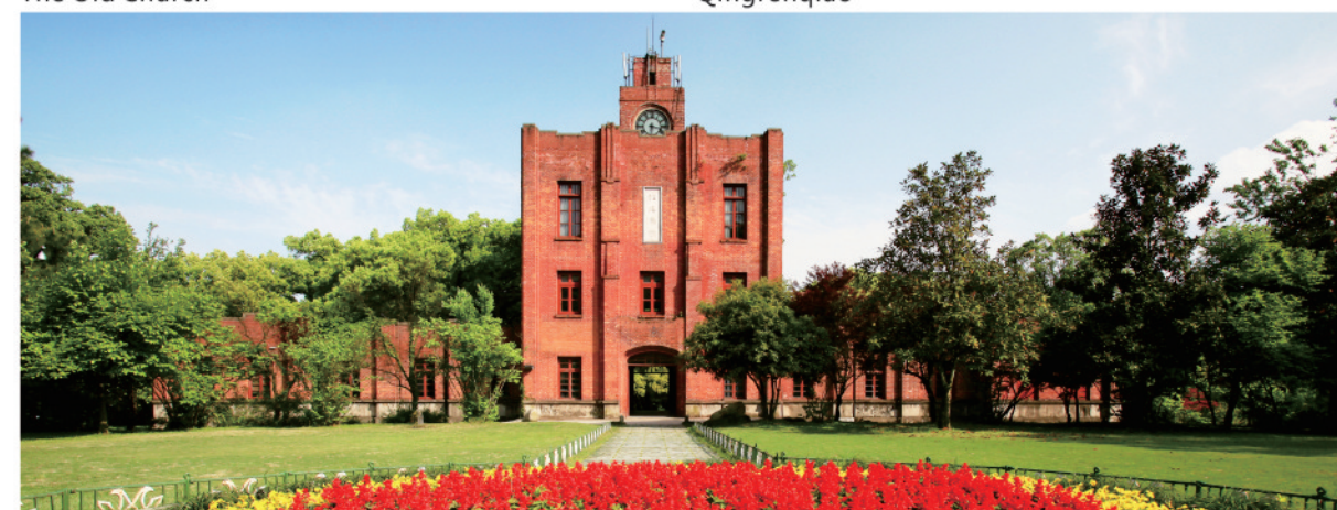
The Bell Tower