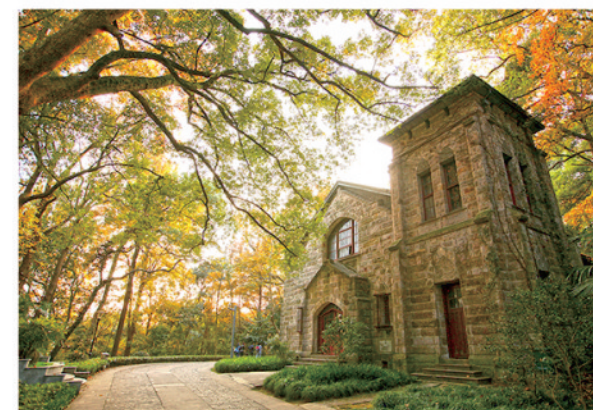
The Old Church