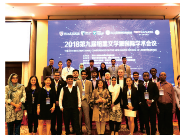
Academic participation in an International Symposium