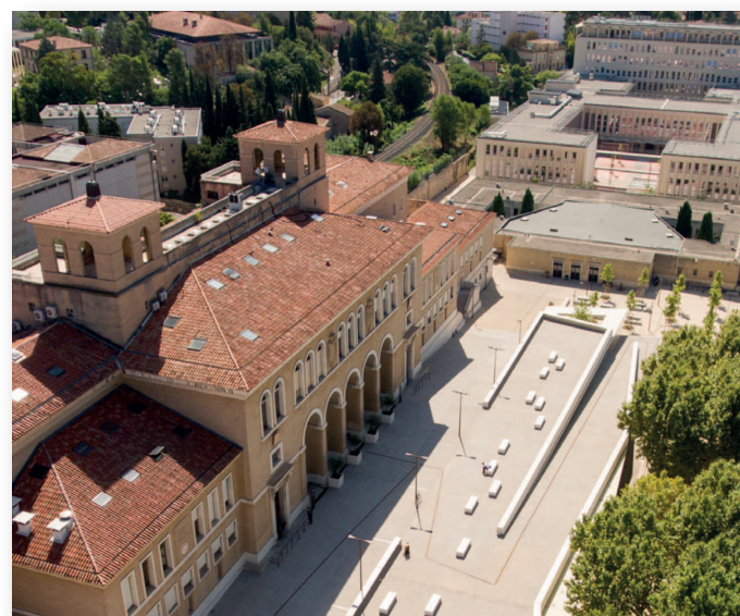
Europe-Asia Research Institute